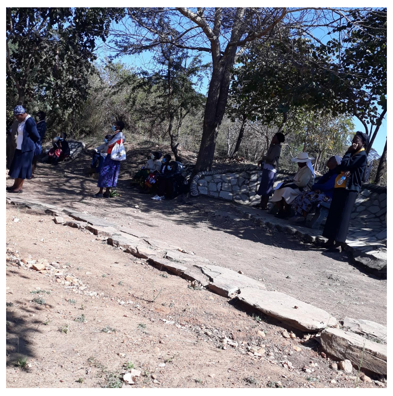
MEMBERS OF STAFF HAVING A DAY OF PARAYER AT THE CARDONER GARDEN IN CHIKUNI