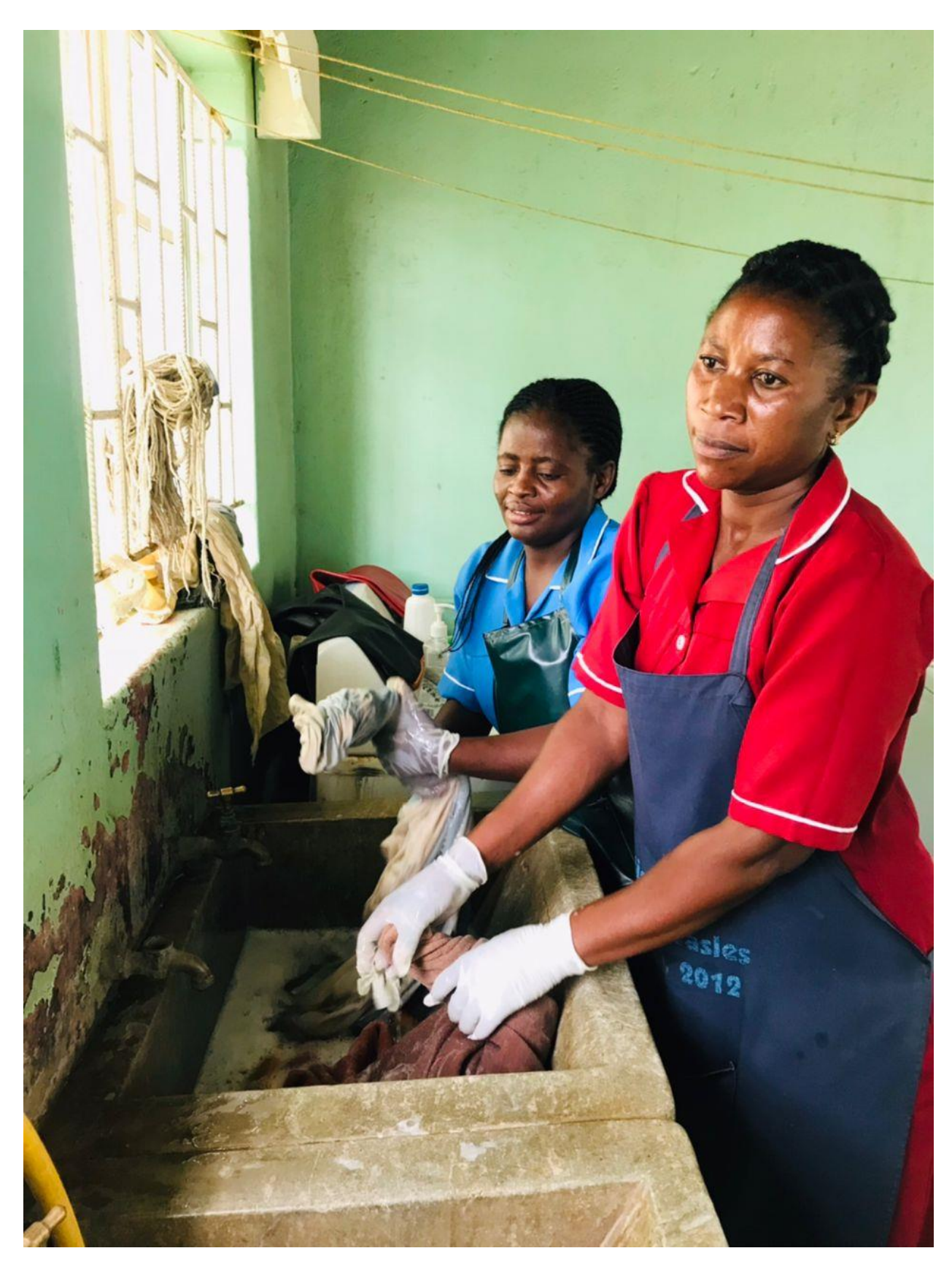
SOME MEMBERS OF STAFF WASHING PATIENTS' LINEN WITH THEIR HANDS