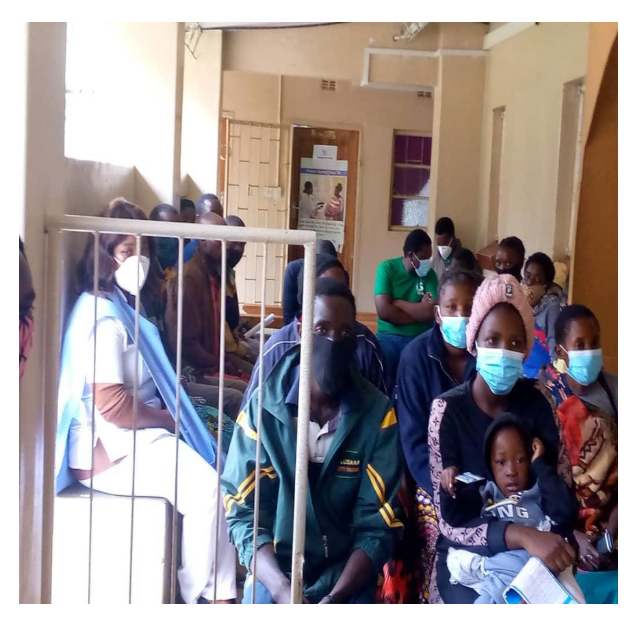
CELEBRATION OF THE DAY FOR THE SICK WITH MASS