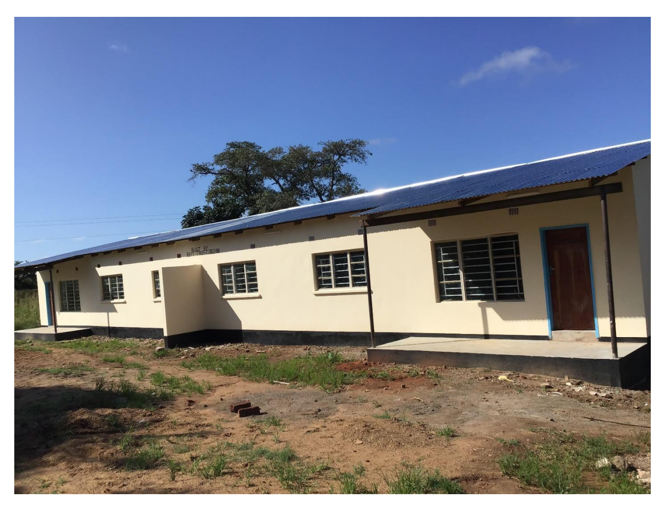
COMPLETED STAFF HOUSES

COMPILED BY SR MUTINTA SIMAANZA HEALTH CENTRE IN CHARGE