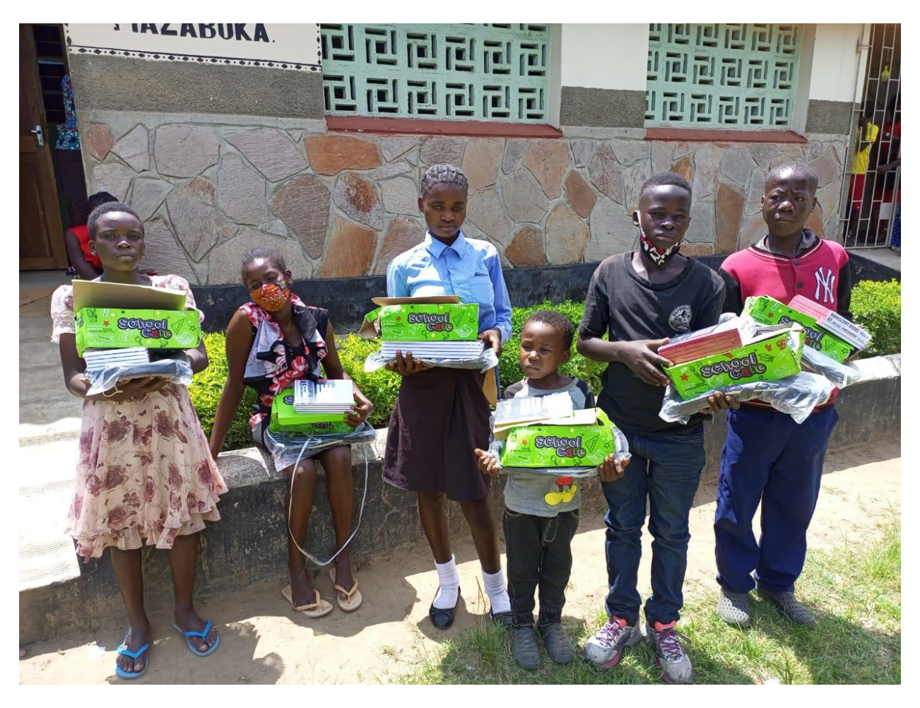
PUPILS SUPPORTED WITH SCHOOL ITEMS THROUGH PCZ UNDER ECAP II