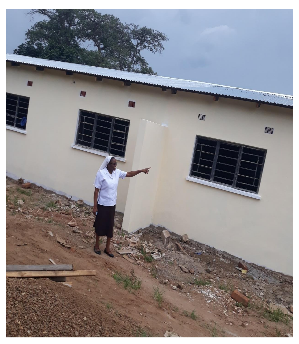
NEWLY CONSTRUCTED STAFF HOUSES