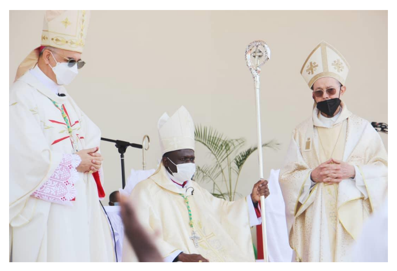
CLINIC STFF PARTICIPATED IN THE CELEBATION OF THE CONSECRATION OF THE NEW BISHOP OF MONZE