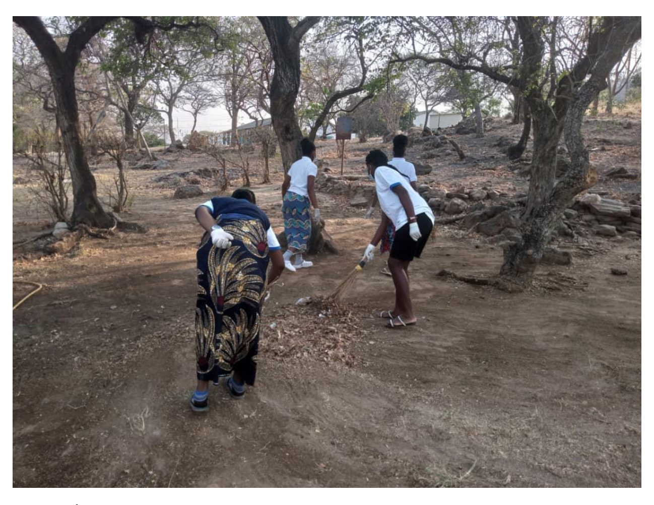
ST JOSEPH'S PUPILS HELPING OUT IN CLEANING THE CLINIC SURROUNDINGS